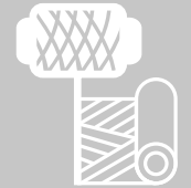
DRAWN TEXTURED FILAMENT YARN

Specialist CoatsKnit products are typically available across a select range of ticket sizes and technical information will in some cases vary from the above table.