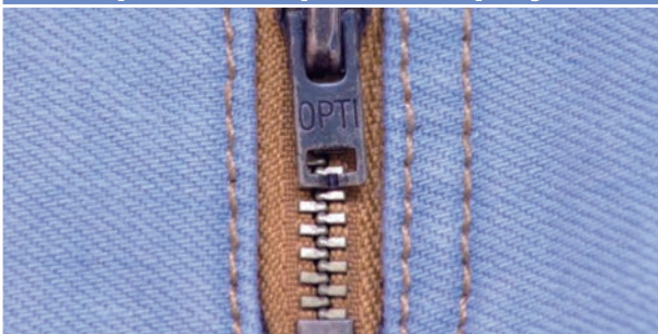
Stone wash + bleach + potassium peroxide spray