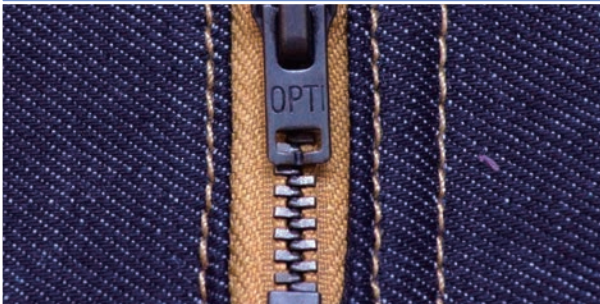
Not treated (unwashed)