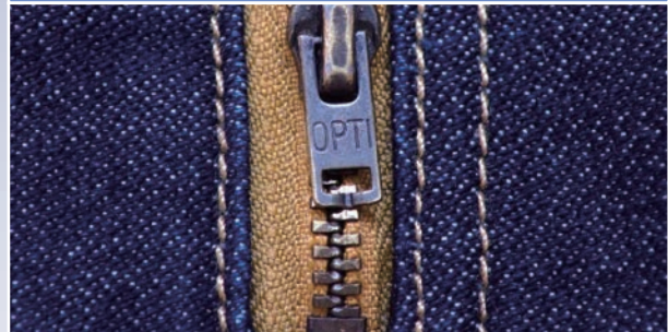
Stone wash 60 min