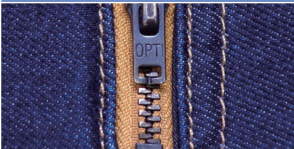
Stone wash + enzyme wash