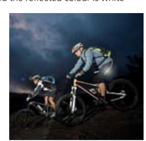
Coats Signal range of retro reflective trims