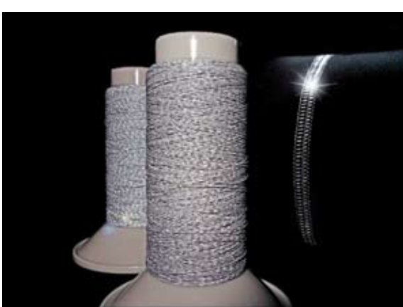
Coats Signal thread