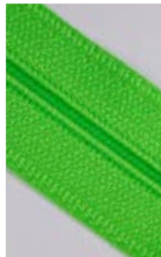
Opti S EcoVerde