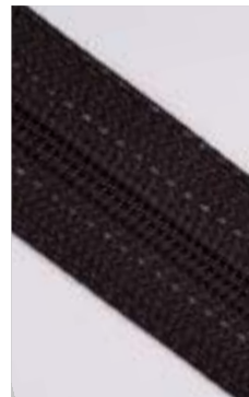
Opti S StitchLine