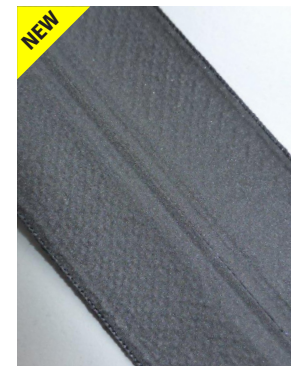
AW (anti-wick finish)