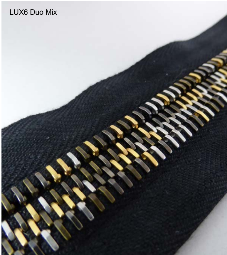
LUX6 Duo Mix