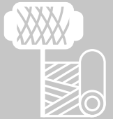
TEXTURED FILAMENT POLYESTER

Specialist CoatsKnit products are typically available across a select range of ticket sizes and technical information will in some cases vary from the above table.